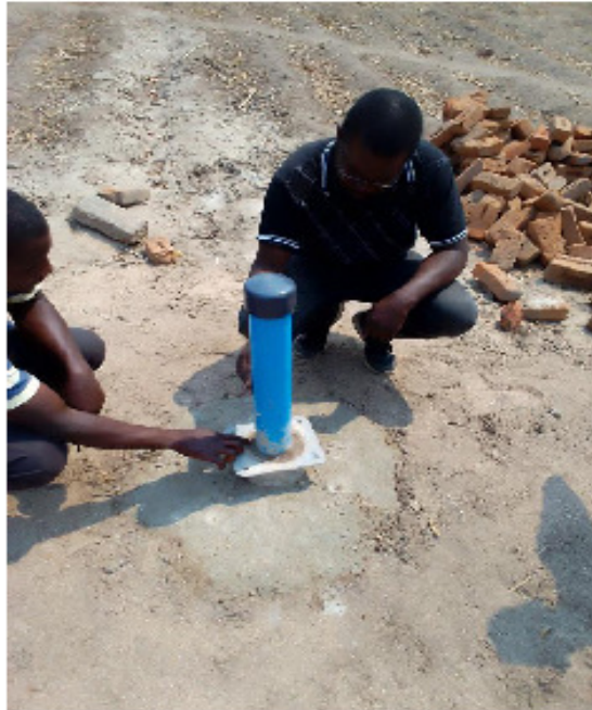
Kapyepe village (Awaiting completion)