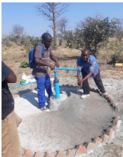
St James Anglican Church