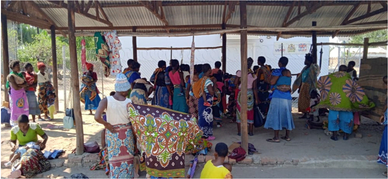
Baby Clinic at Lundu Health Centre

During the year we replaced a vital solar pump that was stolen from the Lundu Health Centre. We have been asked by the chair of the Health Centre whether we can assist in the refurbishment of the Baby Clinic there. There are increased cases of pneumonia and URIs (Upper Respiratory Tract Infections) especially in the under five children. The situation has been caused because the Baby Clinic is not in a good condition. The floor has completely worn away and the mothers and their babies have to sit on the floor in the dust which is now present. This makes the children prone to infections especially Pneumonia, URIs and diarrhoea. To remedy this a new concrete floor and brick built seating will be built so that the mothers and their children can sit in a clean environment.