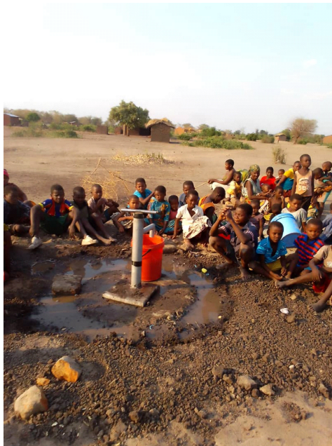
Experimenting with a new locally manufactured pump in the Anglican Project