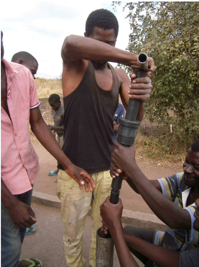
Replacing the pump at Mdala Village

Given the situation Seedsowers Trust decided to fund and rehabilitate the borehole with a replacement pump. This has now been completed and there is a very happy village.