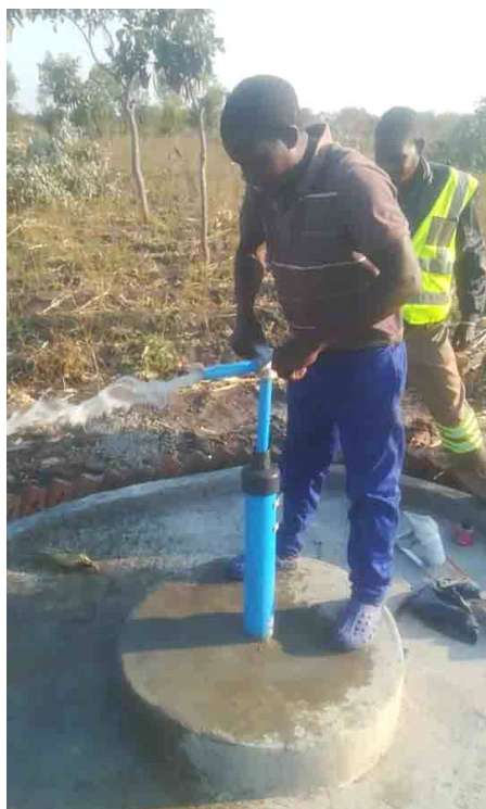
Another completed pump installation of the Anglican Project