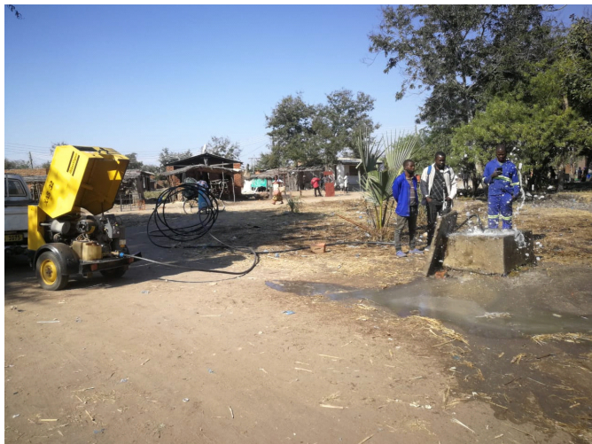
Contractors cleaning out water system prior to installation of replacement solar pump