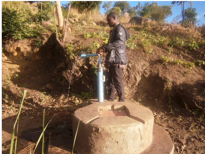
One of the two pump installations sponsored by the donor family

The major activities for the year 2021 could only be commenced in June due to the above reasons and the backlog from 2020 is now completed. Despite the setbacks mentioned above boreholes have been sunk in the Anglican Project (see inside pages).