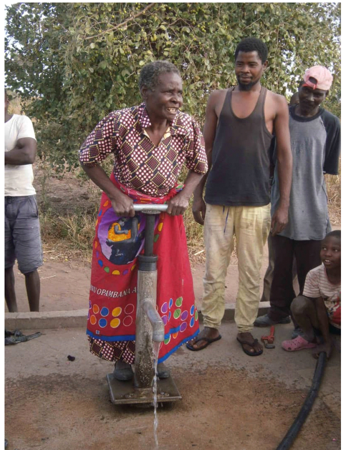
A very happy villager using the newly installed replacement pump at Mdala Village