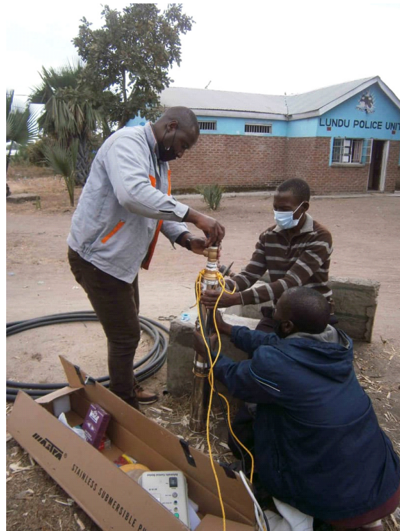
Right -Blantyre Ministry of Health contractors installing the replacement solar pump at Lundu Health Centre funded by Seedsowers Trust

The Lundu Health Centre has been without an essential supply of clean water since the Solar Pump that pumped water from a borehole to a header tank was stolen. This was a source of clean water not only for the Health centre but also for a school and a nearby village. Seed Sowers Trust is funding the replacement pump.