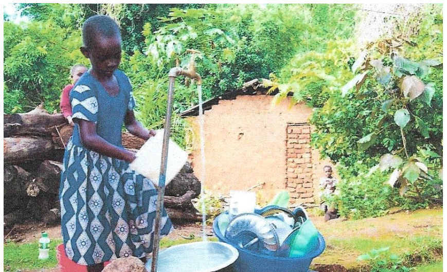
One of the villagers enjoying the luxury of water near their home