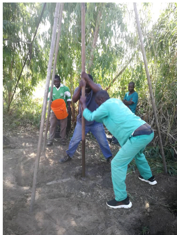
Drilling in progress on site in the Anglican Project