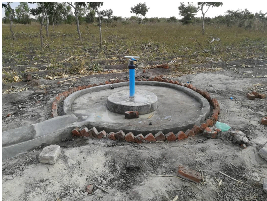
One of the completed Pump Installations at Linjidzi Village