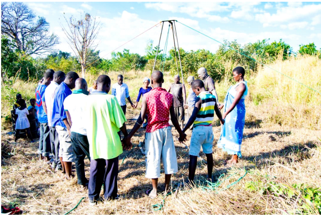
The Drilling Team Praying over one of the Drilling sites prior to commencement of the drilling operation

We can now report that 7 of these boreholes are now nearing completion.