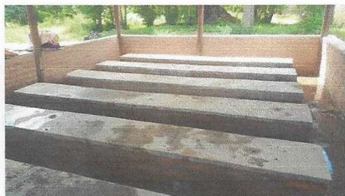
Interior view of the rehabilitation