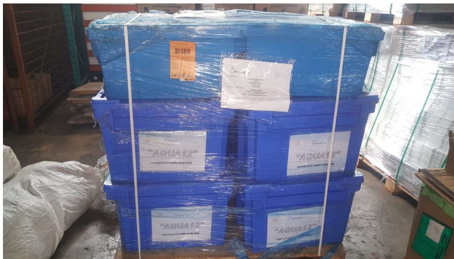
Aquabox consignment of water filters ready for distribution

These filters will allow the contaminated water caused by the flooding to be safely filtered allowing for the processed water to be drunk without fear of disease.