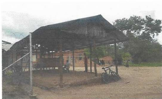
Under Five Clinic before rehabilitation