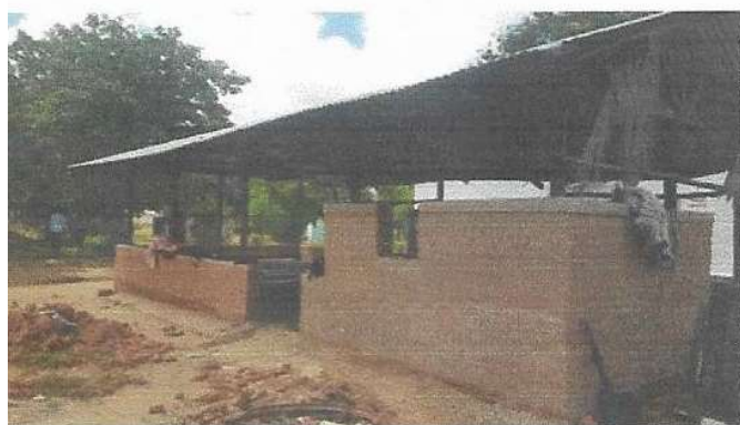
Side view of the rehabilitation in progress