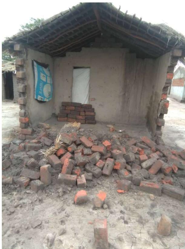
Damaged homes due to Cyclone ANA