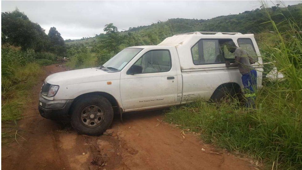
Seedsowers Truck broken down on way to a drilling site

Please would you help us to raise the necessary funds so that the life saving work of Seed Sowers Trust can carry on more efficiently.