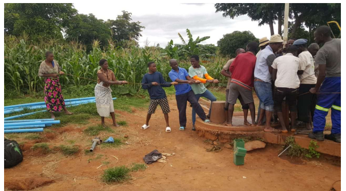
Repair of Cyclone damaged pump being undertaken by villagers overseen by Seedsowers technicians