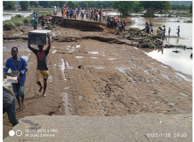
Part of a major road swept away by Cyclone ANA

Our borehole programme was again halted by Cyclone ANA which hit Mozambique and Malawi early in January 2022, causing much damage to crops and housing, especially in the poorer rural villages where we are currently working. This again meant that the drilling programme was to put on hold due to the extensive flooding. In the area where we are working extensive damage has been done to homes, and the crops of the subsistence farmers which have all but been wiped out. After the flooding receded the farmers needed to replant. This has been a great trial for them as the cost of seed and fertiliser has increased to a level which is now unaffordable for them. The global situation resulting from the war in Ukraine is being felt strongly now in Malawi with a huge cost-of-living hike and there is going to be a severe famine here in the very near future. Our country co-ordinator has informed us that there is good news though, as the Covid 19 situation in the country is now less severe and the country is nearly back to pre-Covid levels regarding the health issues.