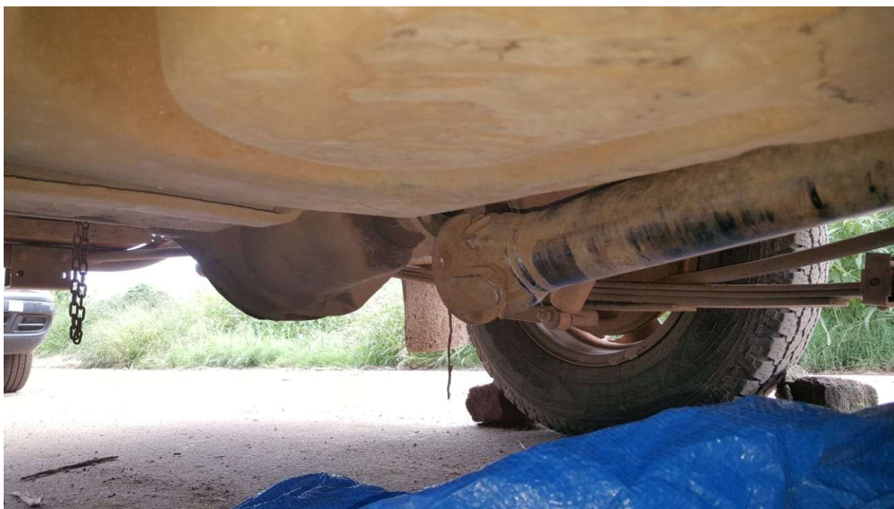
Seedsowers Pickup broken down with damaged Prop Shaft