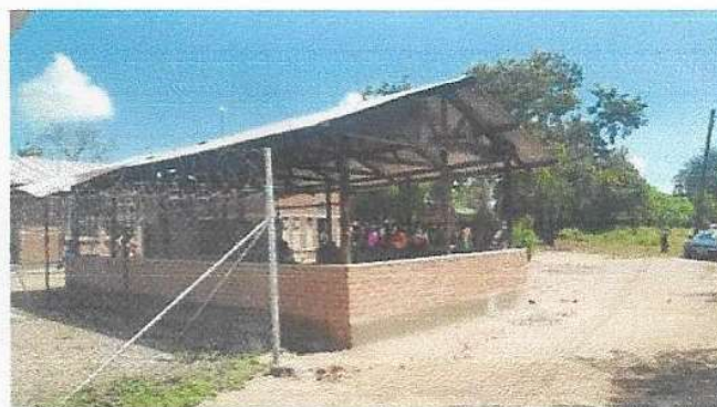
Exterior view of rehabilitation in progress