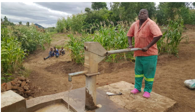
Pump now repaired and in action

Another problem was the terrain in some of the sites was sandy and again a problem with our drilling method. Other sites in the area were very rocky. They have abandoned many drilling sites because of this and have decided to go to sites in the parishes of Mulanje and Chiradzulu after discussions with the Youth Co-ordinator of the Diocese of Southern Malawi. The next 10 boreholes in the Anglican project are commencing on the sites previously mentioned.