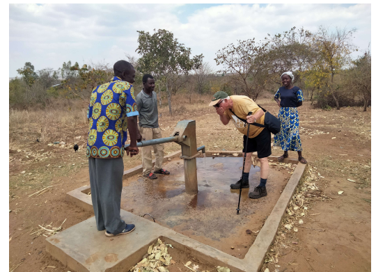
The Seedsowers rehabilitated pump at Nankuyu School