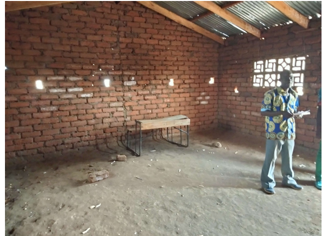
Inside the condemned building at Nankuyu School