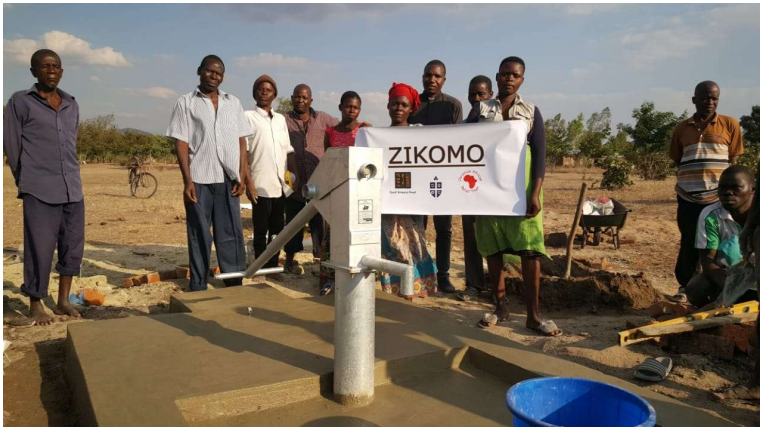
The new Deep Community Borehole in Lijidzi Parish Lundu completed earlier this year. ( ZIKOMO) means thank you in Malawi

In Lijidzi Parish, Lundu, there was a need for 2 deep Afidev boreholes. Unfortunately, due to increasing prices we only have funds for one. Another £1000 is needed to top up to provide the second borehole. The major funding for these boreholes came from CART. The deep boreholes are needed because of the salinity of the shallow wells in the area.