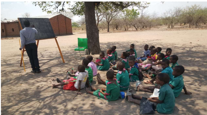
Year one Nankuyu Primary School being taught outside due to lack of accommodation in the school