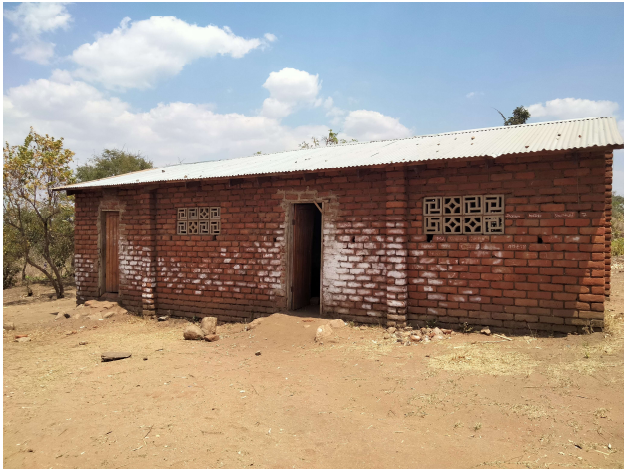
The condemned school block at Nankuyu

Both these schools have very similar problems, both had classroom accommodation problems with the first year students having to have their lessons under a tree with the obvious problems of weather in the rainy season. At the Nankuyu School, the community had raised funds to build the extra accommodation needed but this has been condemned as unsafe by the Education Authority due to its poor unsafe construction. Both these schools lack desks and the children have to sit on a very dusty floor and write using their knees as their desks. Amongst the other problems is the shortage of text books and even chalk for the blackboards. The teachers have really terrible conditions to work in, they themselves being without a desk in most cases.