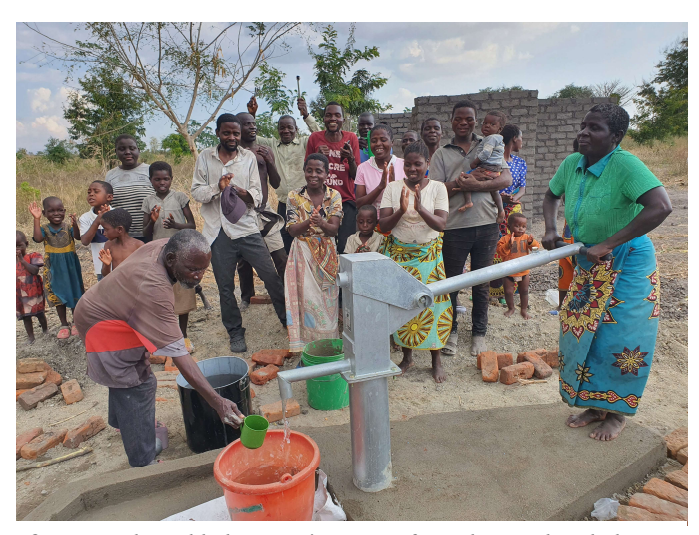
One very pleased lady pumping water from the new borehole. This borehole was enabled by funding from the sponsor Christian Africa Relief Trust (CART)