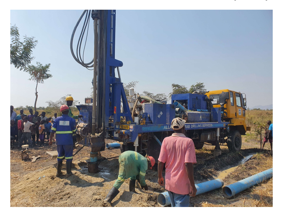
Left- Drilling in progress at Lundu for the installation of the new pump