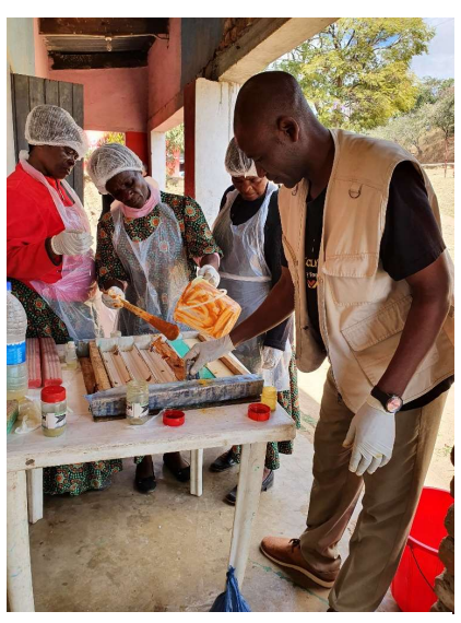
Soap making in progress