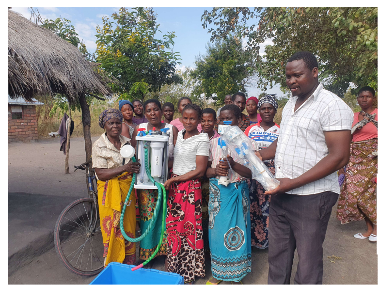
Left- Delivery of Aquabox Filter Kit to a community to purify contaminated water after the Cyclone flooding