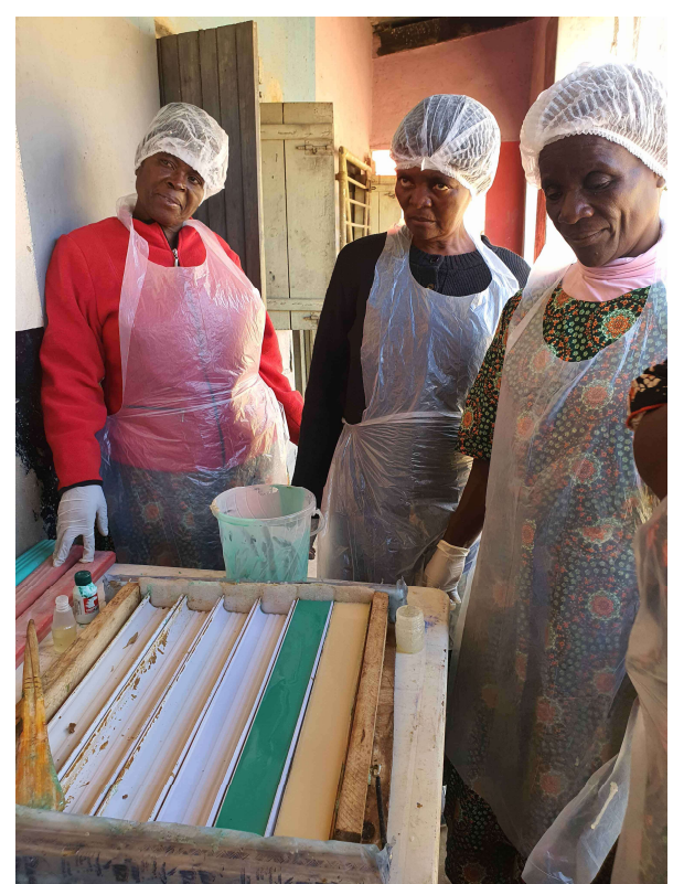
The soap now being set in the moulds