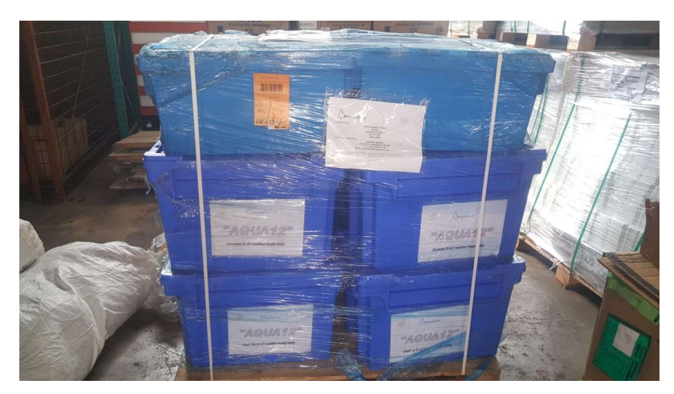
Aquabox consignment of water filters ready for distribution

These filters are very necessary as so many water points and boreholes were contaminated by sewage by the flooding caused by Cyclone Freddy. These filters are also necessary to prevent another outbreak of cholera as happened after Cyclone Ana, which claimed over 2000 lives last year.